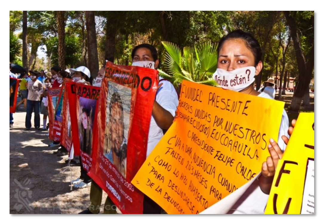
Women demanding a hearing with former President Felipe Calderon, State of Coahuila, Mexico 28

mothers and grandmothers). Every minute that is spent looking for the disappeared person is not being spent on looking for means of income. People in this precarious situation are often discouraged from investigating the case, not only out of fear but for economic reasons. They can furthermore be exposed to sexual harassment or abuse while searching for their loved one.<sup>27</sup> As stated before, female relatives are left in a legal limbo due to the nature of the crime that targeted their male relative. They are unable to inherit, to receive their husband's pension or to remarry, in the absence of a death certificate.