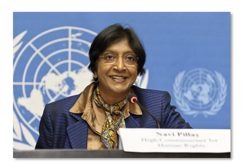
Navi Pillay, United Nations High Commissioner for Human Rights 90

In addition to the important activities of the Working Group on Enforced and Involuntary Disappearances and the Committee on Enforced disappearances presented above<sup>91</sup>, the United Nations addresses the practice of enforced disappearance through the Office of the High Commissioner for Human Rights (OHCHR).