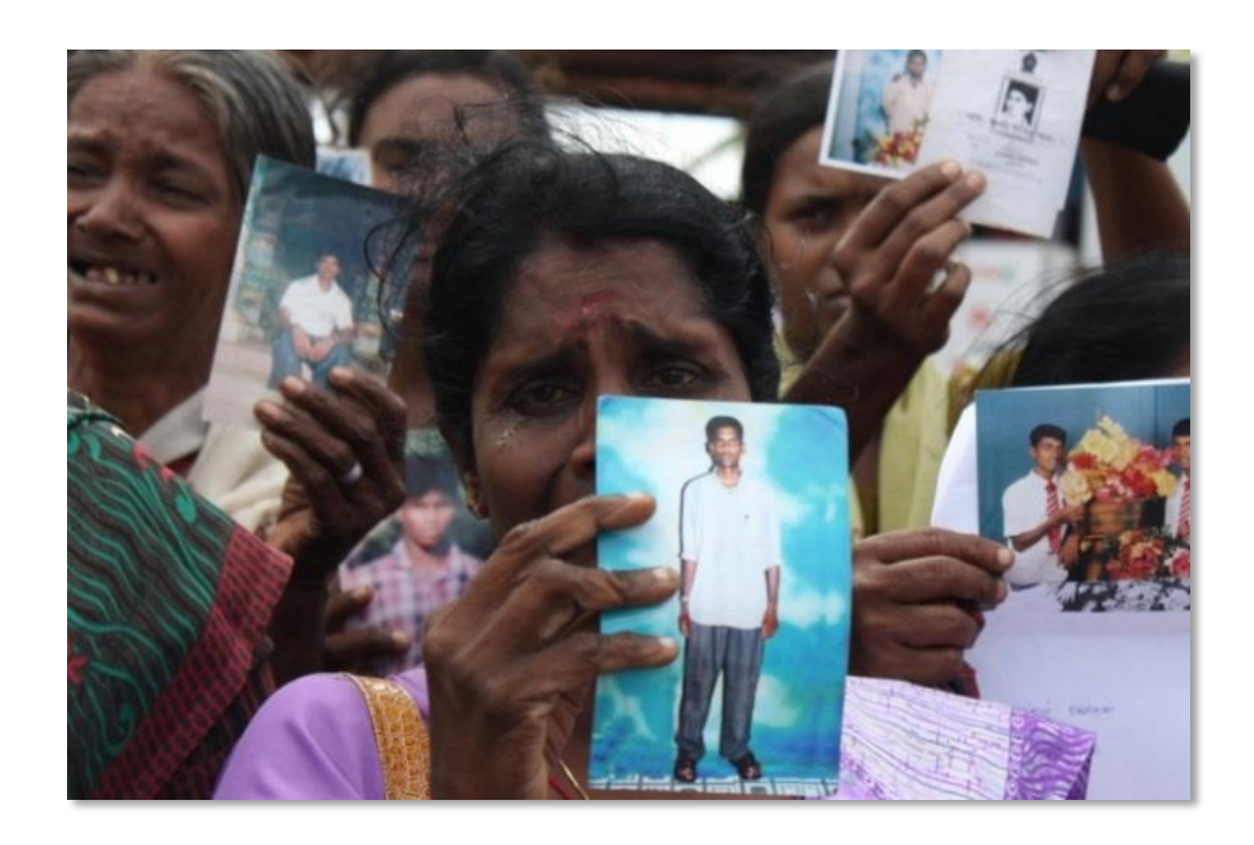
Women looking for a disappeared family member, Sri Lanka 11