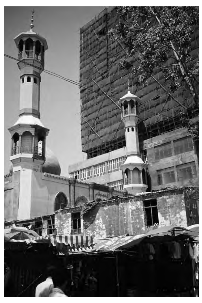
Dilapidated buildings clustered around one of Urumqi's less-frequented mosques in a Uighur section of the city.