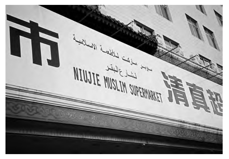
A sign for a Muslim supermarket on Beijing's Niu Jie. The market specializes in Muslim products but caters to Han as well as Hui and Uighur.