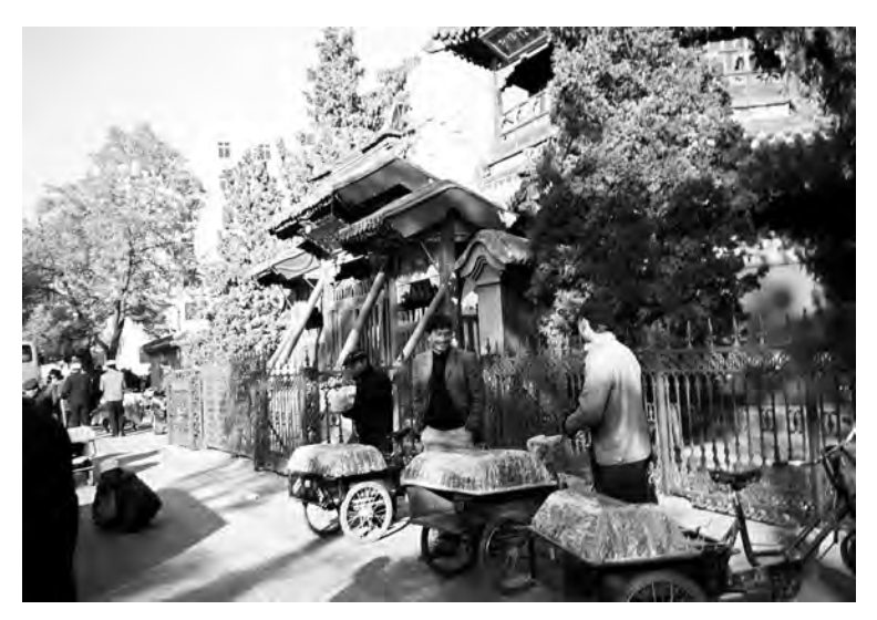
Uighur vendors outside the entrance to the Niu Jie Mosque on a Friday afternoon.