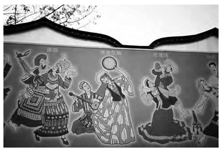
Mural on Beijing's Niu Jie (Cow Street) showing how the Han like to depict China's national minorities. The seated man playing a traditional stringed instrument and the woman dancing with a dap (a hand-held drum that looks like a tambourine) represent the Uighur.