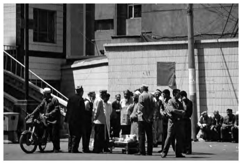
Uighur men congregating around a beverage stand after Friday prayer services.