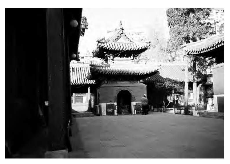
The inner courtyard of the Niu Jie Mosque. Originally built in 1362 in the style of a traditional Chinese temple, the mosque was renovated in 1978.