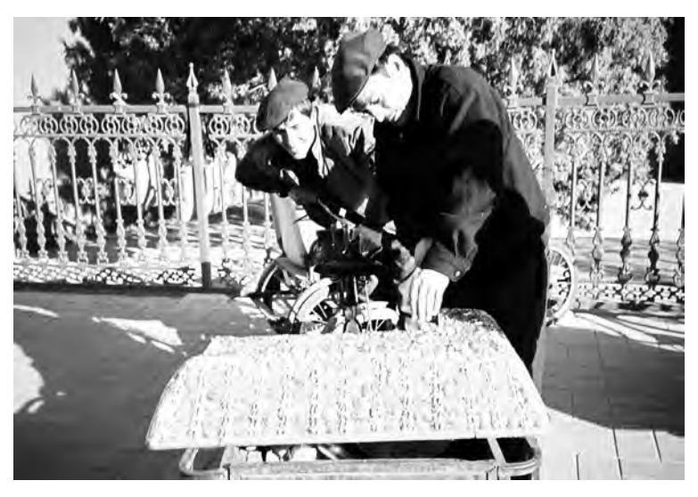
A Uighur man buying a piece of honey cake (a traditional Uighur delicacy) from a street vendor.