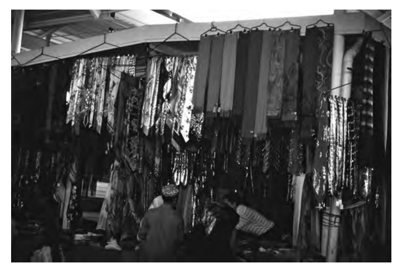
A silk stall displaying traditional Uighur patterns in the new market built on the outskirts of Kashgar.