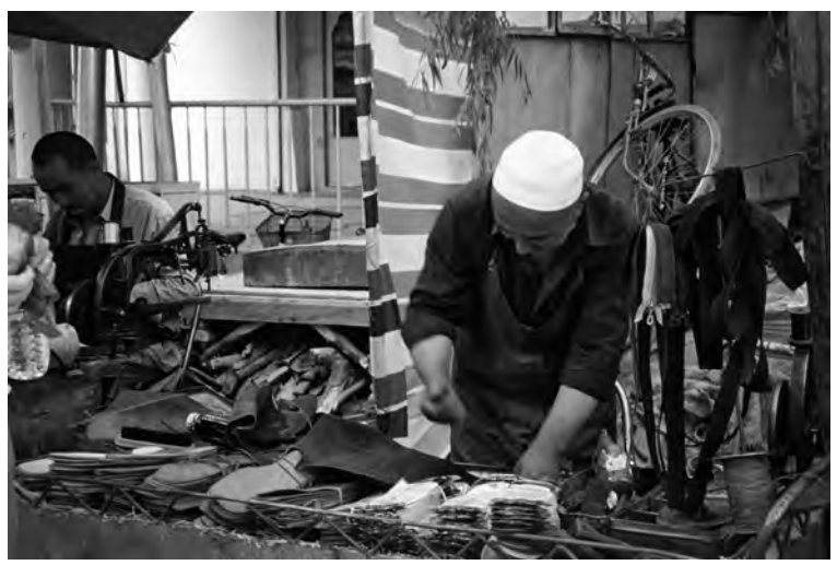
A Uighur cobbler working in a street stall in Kashgar.