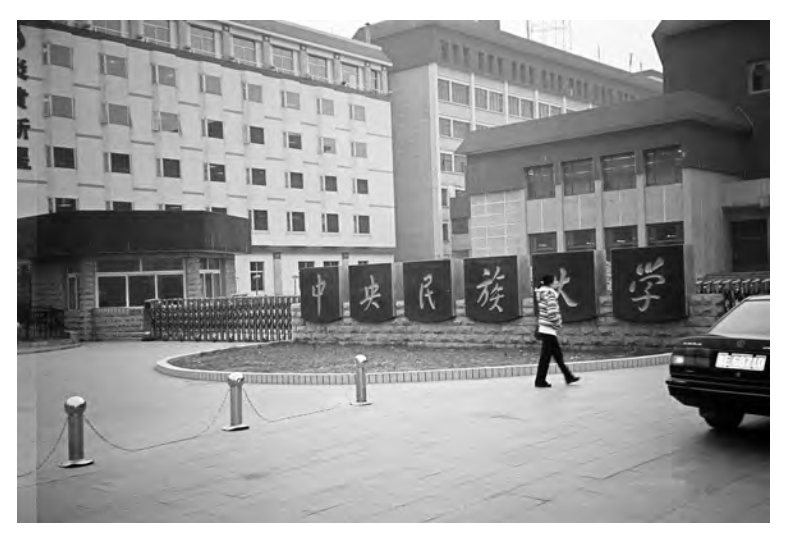
The campus of the Zhong Yang Min Zu Da Xue (Central Minority University) in the Wei Gong Cun suburb of Beijing. Very few minority students attend the university—most students are Han.