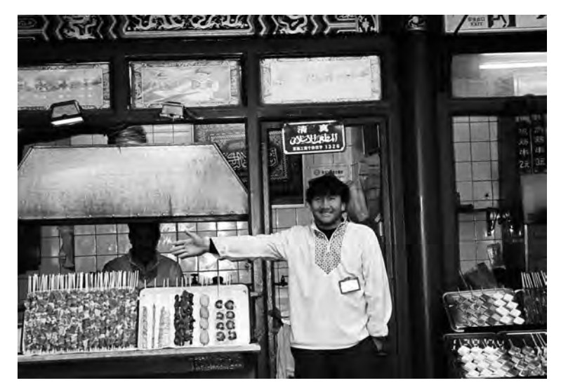
A Uighur goat meat seller in front of his shop in Beijing.