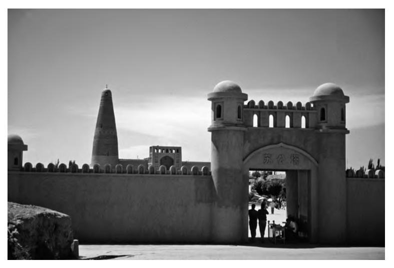
The entrance to the Imin pagoda and mosque in Turpan. Built in 1778, the 141-foot-high pagoda is a popular tourist site.