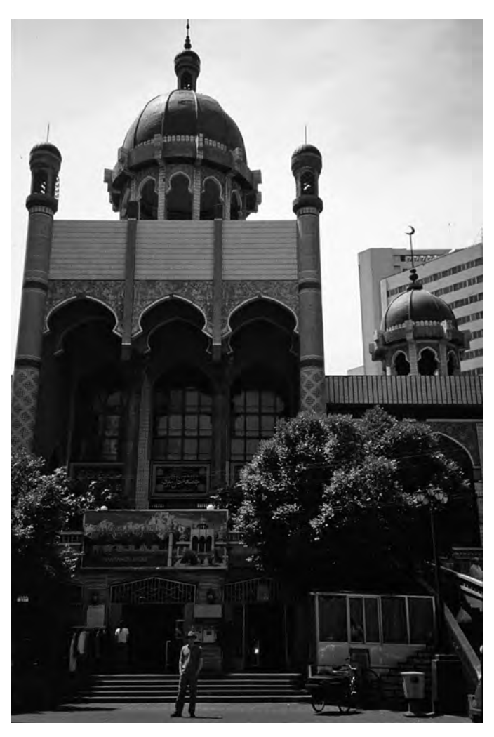
Urumqi's Hantangri Mosque. Built in 1864, it is the city's largest. The ground floor is a Uighur shopping bazaar.