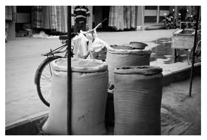
Sacks of Uighur tobacco on a Kashgar street. Many Uighur roll their own cigarettes.