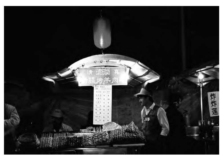
A Uighur selling goat meat from a cart at a Beijing night market.