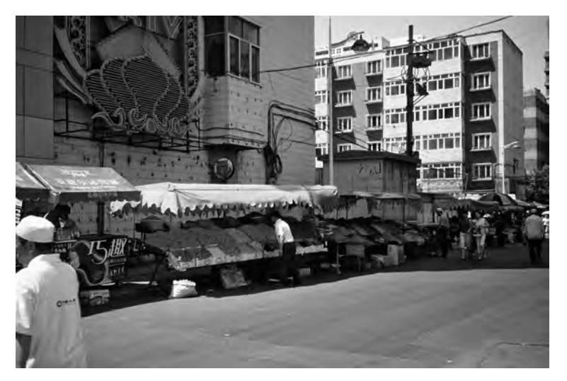
A Uighur food market in Urumqi.