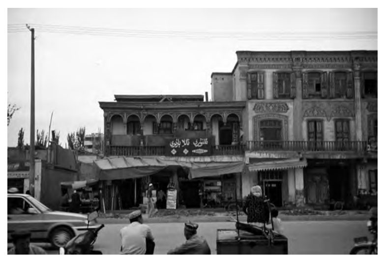
Older, run-down buildings in a Uighur section of Kashgar.