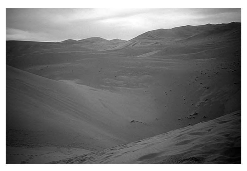
The barren landscape of Xinjiang's Taklamakan Desert, known as the Sea of Death.