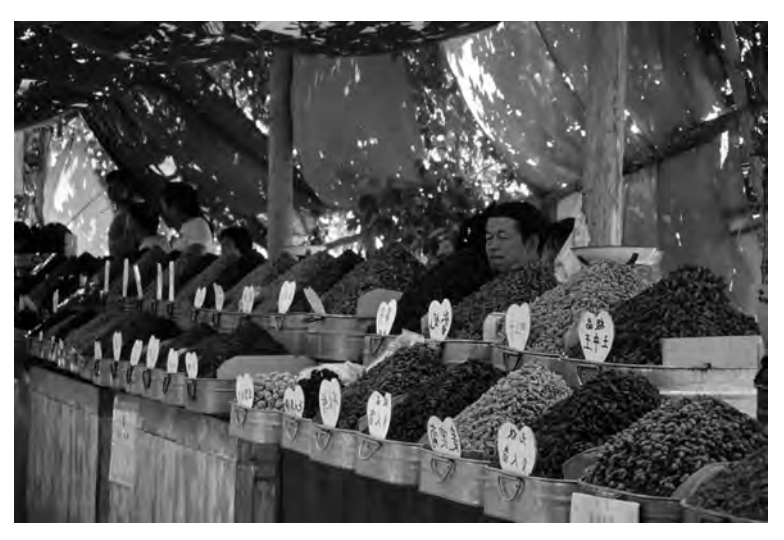
A Uighur raisin seller in Xinjiang's Grape Valley. Located eight miles east of Turpan, the valley's vineyards produce some of China's best-known wines.