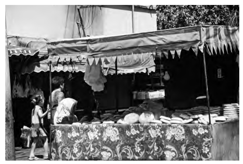
A Uighur woman selling nang bread.