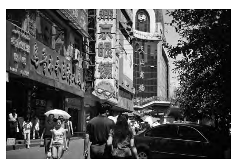
Shoppers in a prosperous Han section of Urumqi.