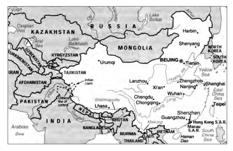
China and its major cities.