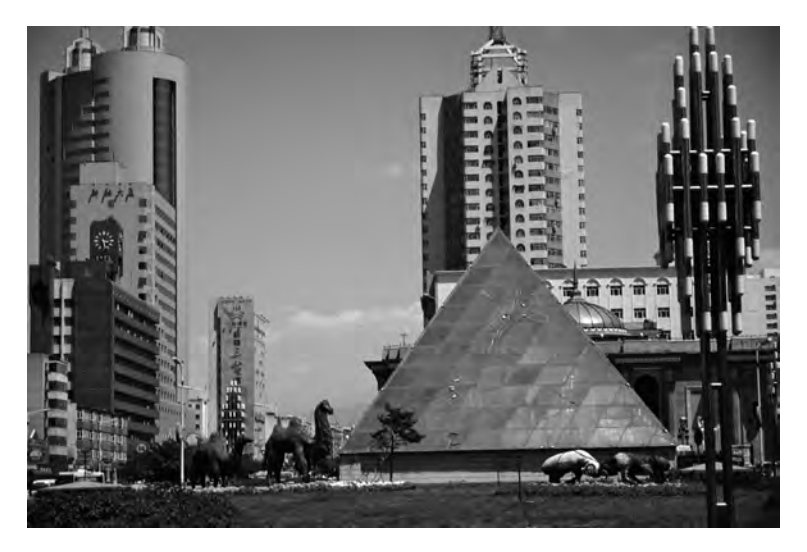
Modern buildings surrounding Ren Min Square in the Han section of Urumqi.