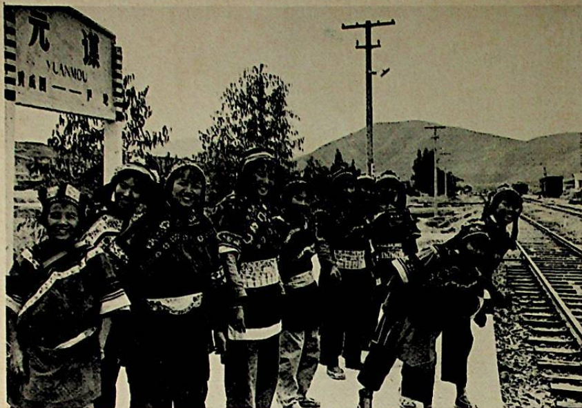
Waiting for the first train on the Chengtu-Kunming Railway.

This book tells the story of the great achievements of China's fifty-four minority peoples in the last 50 years. Beginning before Liberation on the "Long March", proceeding through the New Democratic period to Socialism, on to the Cultural Revolution and up to the present day, this selection of articles graphically depicts the tremendous leap which these peoples have made. Many of them have gone from serfdom to socialism in a mere twenty-five years.