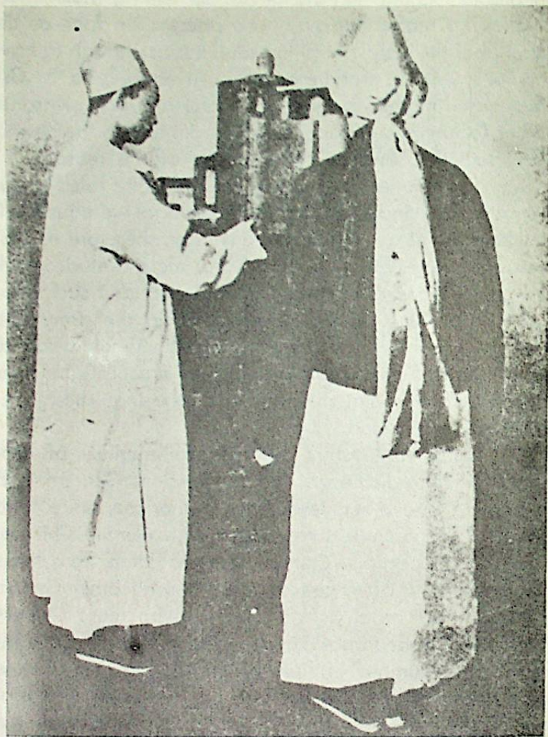
CHINESE JEWS AT THE CEREMONY OF READING THE TORAH