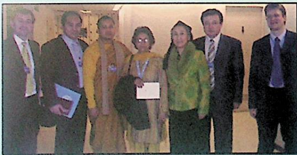
Ms. Rebiya Kadeer meets with UNs Special Rapporteur on Freedom, Religion and Belief Ms. Asma Jahangir