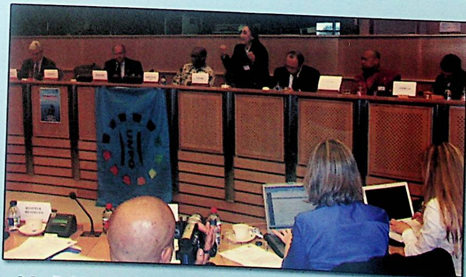
Ms. Rebiya Kadeer speaking at the 9th General Assembly of the UNPO in the European Parliament