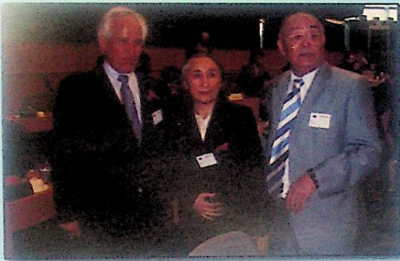
Ms. Rebiya Kadeer and Mr. Erkin Alptekin at the European Parliament