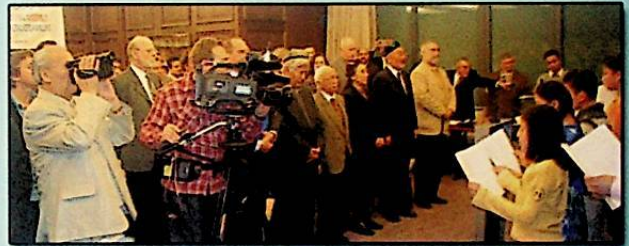
The delegates of the WUC singing the National Emblem at opening ceremony of General Assembly.