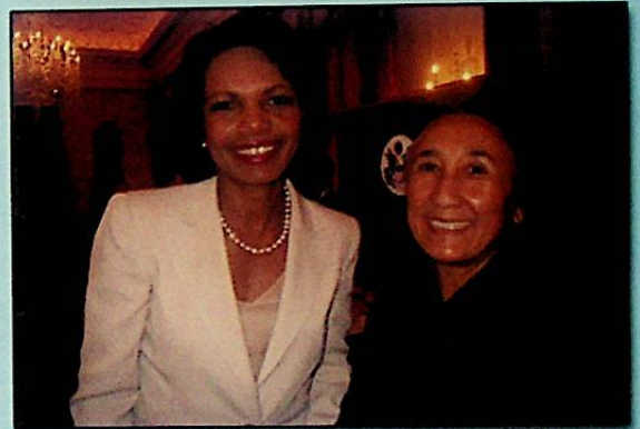
Ms. Rebiya Kadeer with U.S. Secretary of State Ms. Condoleezza Rice