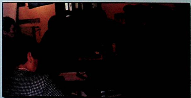
Delegates during the group discussions at the General Assembly