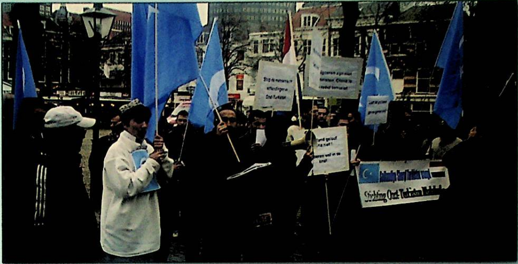
A demonstration in Netherlands against the Chinese government