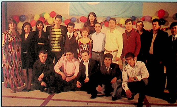
A Uyghur Youth Festival in Europe is celebrated in Sweden