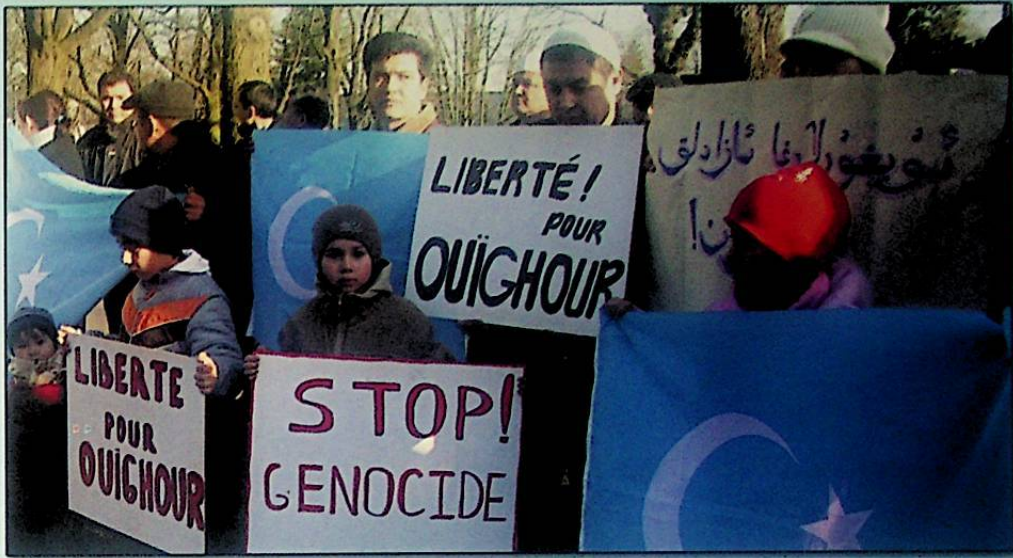
A demonstration in Belgium against the Chinese government