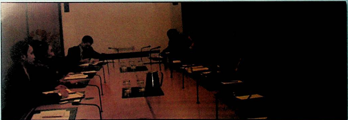
Ms. Rebiya Kadeer and fellow WUC delegates at the Australian Parliament