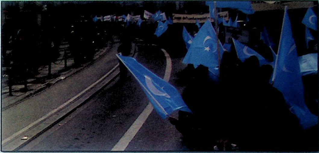
A demonstration in Germany in commemoration of the 10th Anniversary of the Ghulja massacre