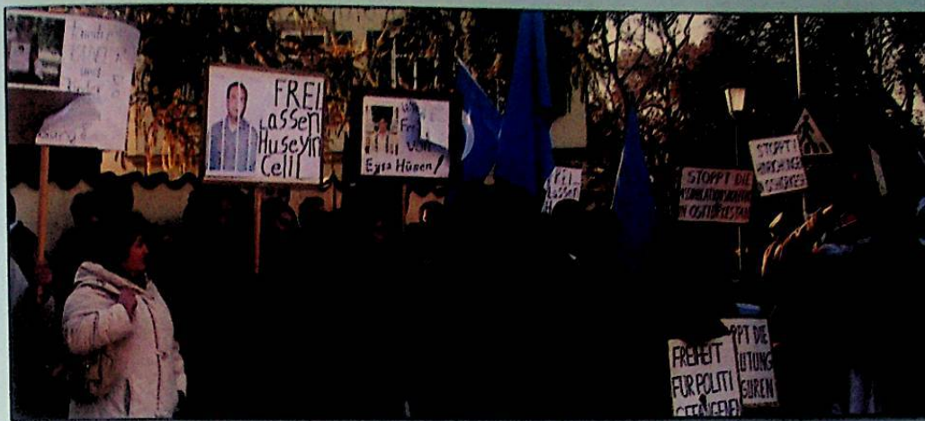
The delegates demonstrating in front of the Chinese Consulate in Munich at the end of the General Assembly