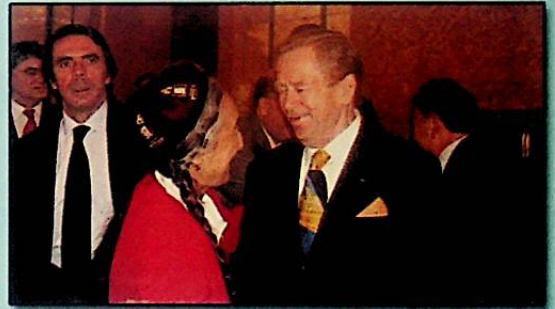
Ms. Rebiya Kadeer with former president of the Czech Republic Mr. Vaclav Havel