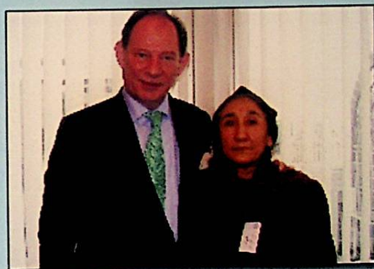
Ms. Rebiya Kadeer meets with vice president of the European Parliament Mr. Edward McMillan-Scott