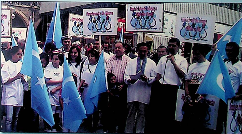
A scene from a demonstration in Munich against the 2008 Beijing Olympics