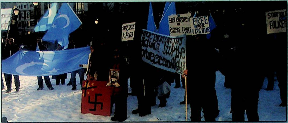
A demonstration in Norway in commemoration of the 10th Anniversary of the Ghulja massacre