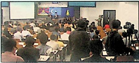
A scene from an international Uyghur-Tibet-Inner Mongolian Conference in Tokyo