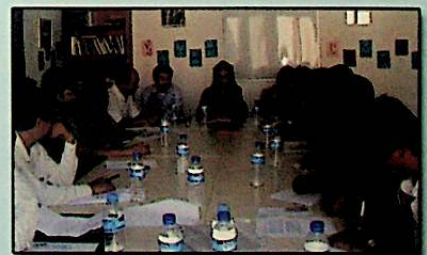
A scene from WUC's Executive Committee meeting