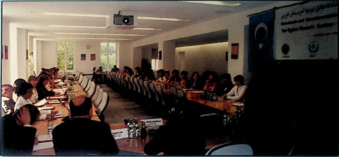
A scene from the Uyghur Women's Training Seminar at the Bavarian Parliament