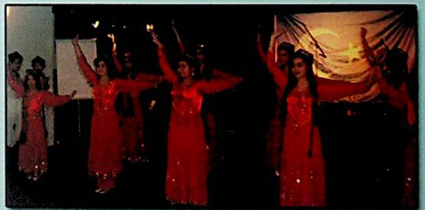
Uyghur girls performing at the Newruz celebration in Germany