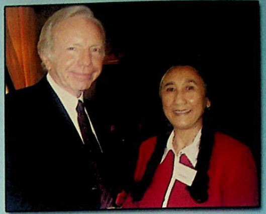
Ms. Rebiya Kadeer with U.S. Senator Mr. Joe Lieberman