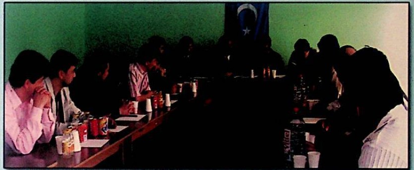
East Turkistan Union was founded in Frankfurt