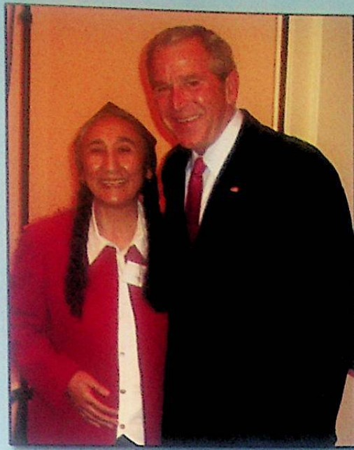
Ms. Rebiya Kadeer meets with U.S. President George W. Bush