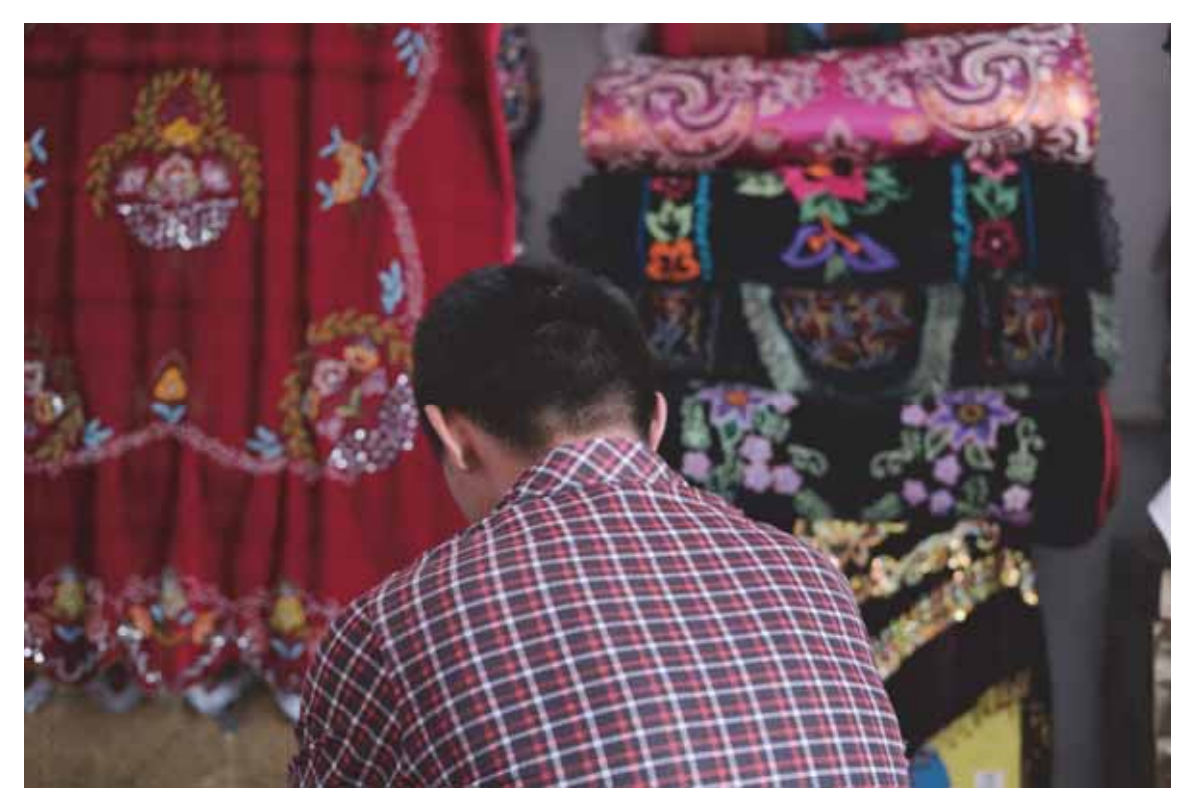
An interviewee says that his younger brother and sister have both been taken to political education camps.

In some cases, it is the former employers who convey the message. Garri, 78, residing in a country bordering China, told Human Rights Watch that four close family members have been told to go back to China that way: