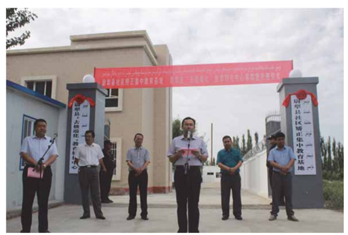
Officials unveil a new political education camp in Bayingolin, Xinjiang.