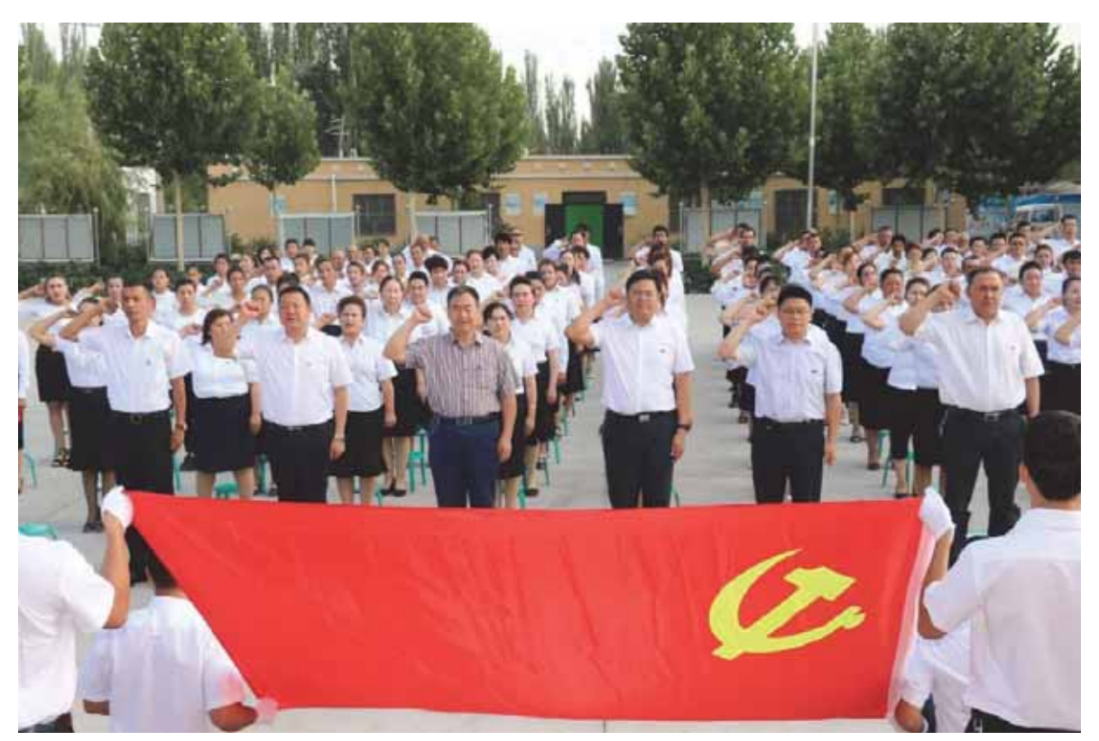
Village officials swear allegiance to the Chinese Communist Party in Kashgar, Xinjiang.

Under the Strike Hard Campaign, Turkic Muslims are required to attend a variety of political indoctrination gatherings. Many interviewees said everyone in their community has to attend flag-raising ceremonies with the People's Republic of China's national flag on a weekly or daily basis: