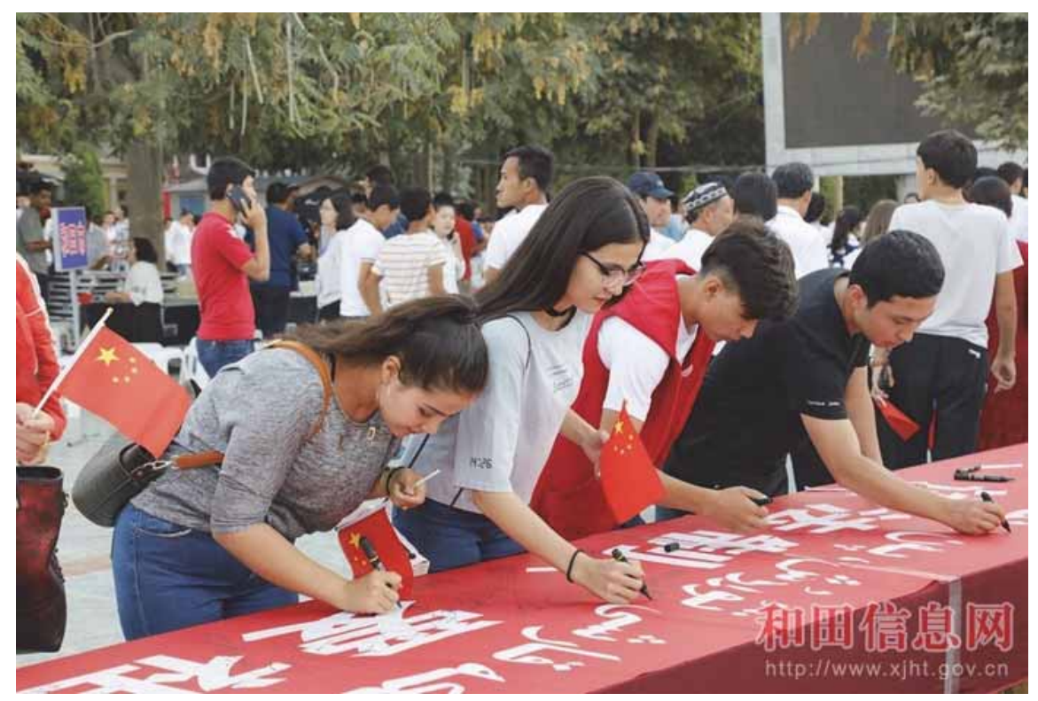
Students sign their names on a banner that reads, among other slogans, "Love the Motherland" in Hotan, Xinjiang.

Iham also described to Human Rights Watch examples of these denunciations: