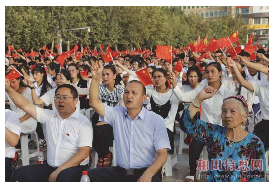
People denounce the "three evil forces" in a mass political meeting in Hotan, Xinjiang.

Alim told Human Rights Watch that the neighborhood office made him deliver a progovernment speech at one such meeting: