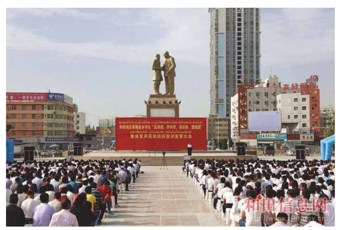
Over 5000 students pledge loyalty to the "Motherland" in a July mass ceremony in Hotan, Xinjiang.

On Monday flag ceremony, you have to show your ID, or if you miss several times in a row, someone would tell on you and then you'd be punished.<sup>152</sup>