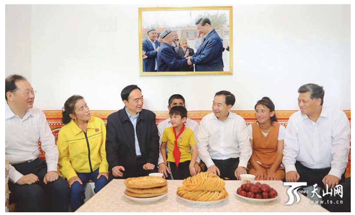
Xinjiang Party Secretary Chen Quanguo (third from left) in a state press photo visiting a Turkic Muslim family in Xinjiang.