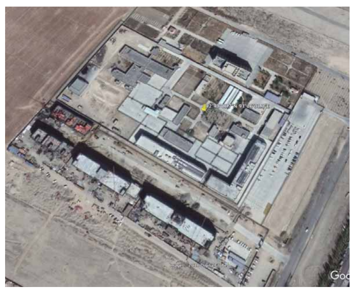
Satellite imagery of a political education camp in Hami, Xinjiang. It was converted from a disease control center.

[The guards] then cut the hair of the girls. There were some girls with long braided hair [but it was] all cut. [The girls...] thought they were going to be released. The girls were all smiling and happy [when they went out] ... but they came back crying and wailing. I was crying with them. I was against this, and I said, 'Why did you do this?' The guards said, 'Why do you care about women's hair?' I must have cursed the guards and ... they made me stand up straight for 24 hours.... There were many days when I was punished by standing up for 24 hours.