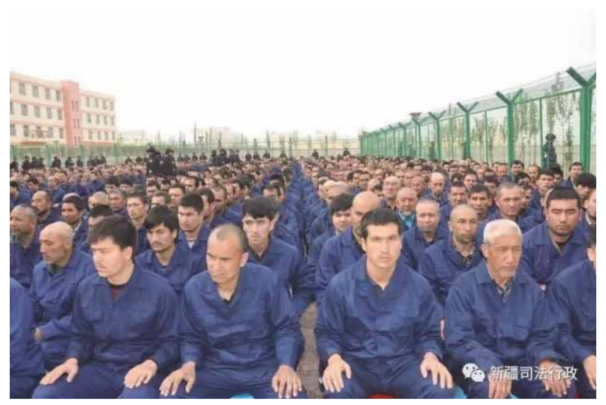
Government social media post in April 2017 shows detainees in a political education camp in Lop County, Hotan Prefecture, Xinjiang.

Interviewees told Human Rights Watch that their fellow detainees were held in political education camps for having relationships with people in the list of 26 foreign countries, or for having practiced Islam. Erkin told Human Rights Watch: