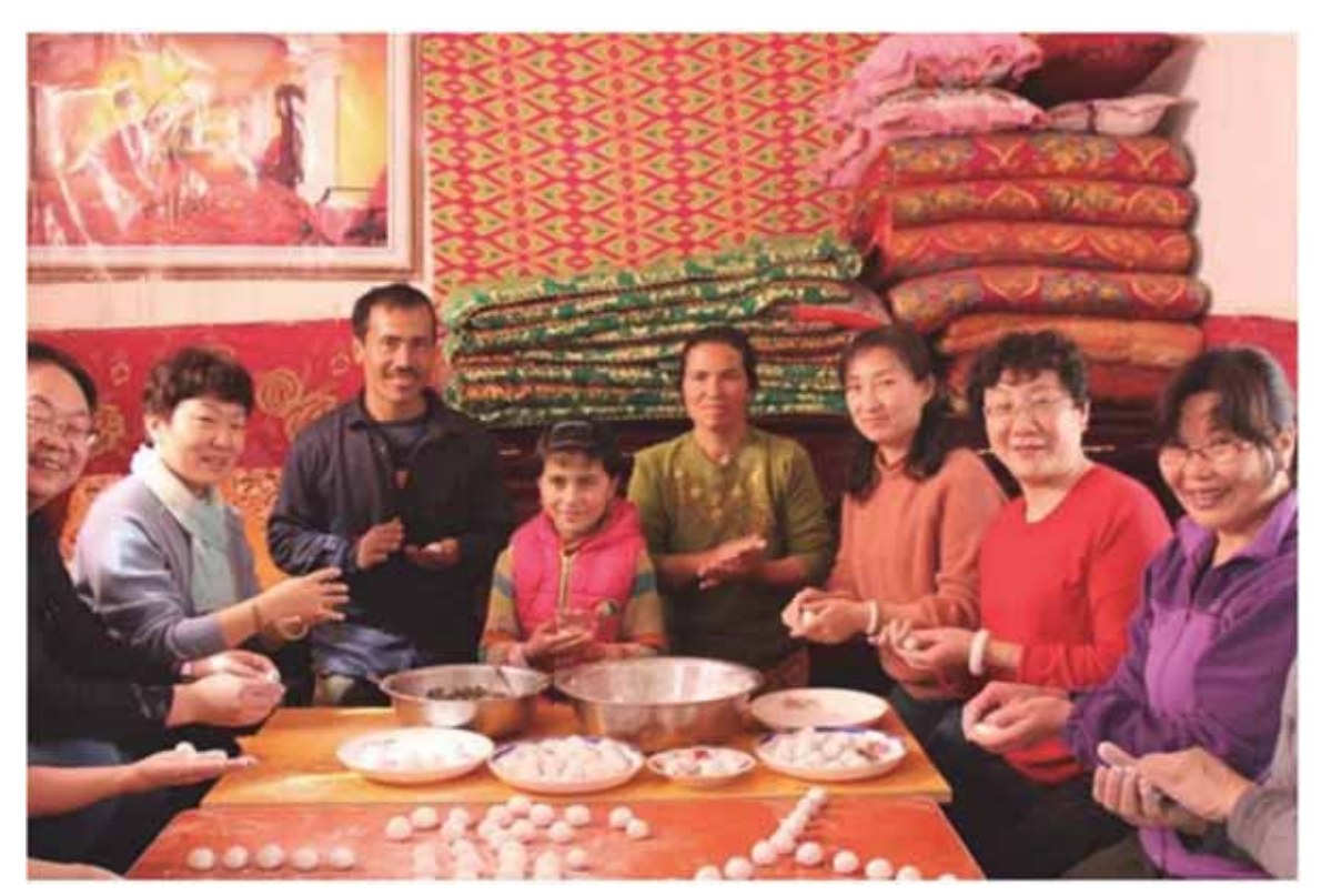
A State press photo showing Chinese officials staying with Turkic Muslim families during compulsory homestay "Becoming Family" program in Xinjiang.

Official reports about these programs say the length of the stays depend on the political trustworthiness of the families. Those who are considered suspicious are subjected to lengthier, or more frequent, stays: