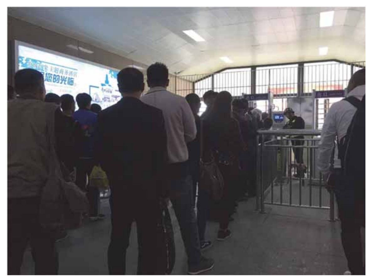
A checkpoint equipped with facial recognition in Turpan, Xinjiang. The photographer noted that police let Han through a fast lane without checking them while Turkic Muslims were in long lines waiting for a thorough security check.

One person told Human Rights Watch that he was at an official meeting when the authorities discussed these "green channels":