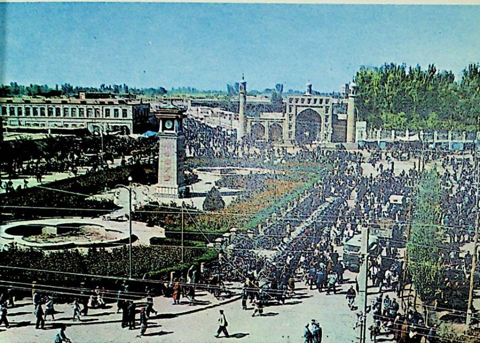
The Ailagol Mosque in Kashgar, Sinkiang Uighur Autonomous Region. Built in the 9th century, it is a historical site preserved by the state.