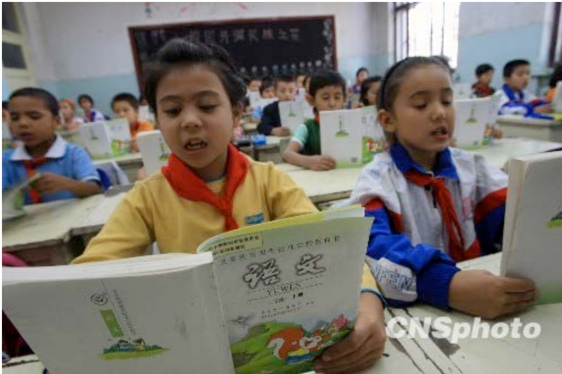
Uyghur third-graders in Urumchi study in Chinese, 2009.

Since its purpose is to increase ethnic education quality and nurture technological talent and the ability to “communicate between Hans and minorities,” then this bilingual talent should have employment opportunities, allowing these university students to realize their potential. So how has it happened that Uyghur students have such difficulty finding employment, which sends the message that “schooling is worthless”?