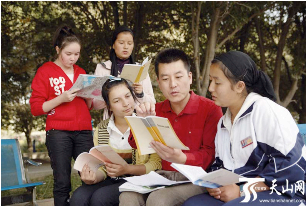
A Chinese teacher in Mekit County, near Kashgar, instructing Uyghur students.

What is termed “bilingual education” is nearly a monolingual education in Mandarin, eliminating Uyghur language from the academic sphere of young Uyghurs’ lives and assimilating Uyghurs into the Chinese culture. Implementation of the government’s bilingual education policy has resulted in reduction in the availability of Uyghur instruction, closing of Uyghurs schools, poor conditions in schools serving Uyghur communities, and unemployment difficulties for Uyghur teachers not capable of teaching in Mandarin. A shortage of bilingual teachers has led to the hiring of unqualified Han instructors to fill the gap.