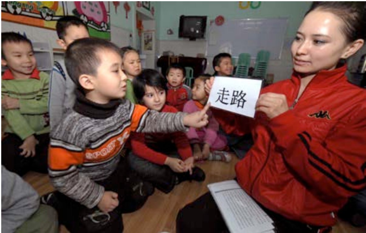
Uyghur kindergarten students learn Chinese characters in Urumchi, February 26, 2009.

Expansion of bilingual education into kindergarten has been aggressive. In 2010, a multi-billion yuan investment funded programs at nearly 1,700 kindergartens. 44 The government invested in 1,016 new bilingual pre-schools with aims to recruit 20,000 bilingual pre-school teachers, and 60% of regional pre-schoolers in the region received 2-year bilingual Mandarin education at the time. 45 By February 2015, 450,000 children have received bilingual education from kindergartens and of 34,500 recruitment vacancies listed by the education department, 3,500 are for kindergarten teachers. 46