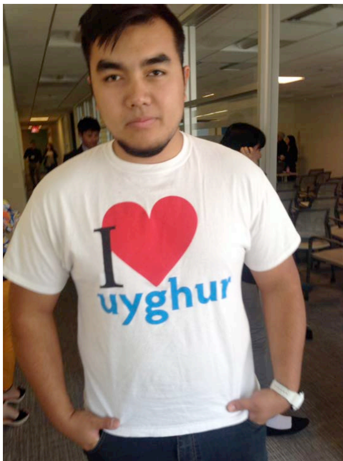
Participant in World Uyghur Congress youth training in Washington, DC, May 7, 2015.

At this point, perhaps people will wonder: why did I not go directly to Uyghur school? In fact, in my hometown there were already no more pure Uyghur language schools. Even in what is considered a Uyghur language school, only Uyghur languages classes were taught in Uyghur, and all other classes used Mandarin instruction. I even heard from my nephew that now they do not begin teaching Uyghur until the third grade. The subtle influence of the Chinese government's so-called bilingual education policy has changed children's thinking. From the time they first enter school until the third grade, children have already accepted the language system from their first phase of school as a fixed way of thinking in their growing minds. Because they wait until the third grade for any mother tongue instruction, for them it becomes as challenging as studying a foreign language. Whether on a major street or a public bus, it isn't hard to find a group of Uyghur children laughing and joking together; however the language of conversation in their mouths is almost always Mandarin. This situation of the Hanification of Uyghurs is getting more severe every day. What is happening to us?