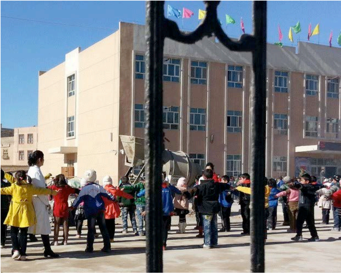
A teacher leads a group of Uyghur children exercising on a school in Kashgar, Nov. 8, 2013

“grandpa computers” (that is the nickname we gave to those computers). Whereas the first school had been a Mandarin school, the second school was previously a Uyghur language school.