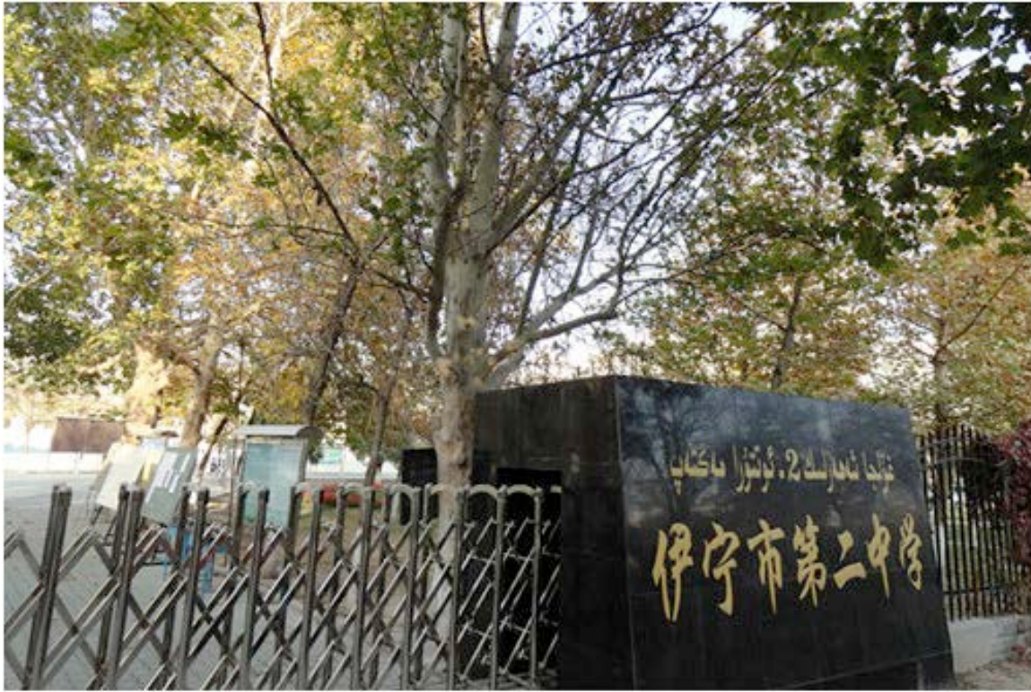
Gate of Ghulja City No. 2 High school