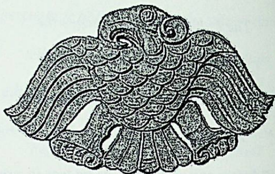
The Uyghur Eagle