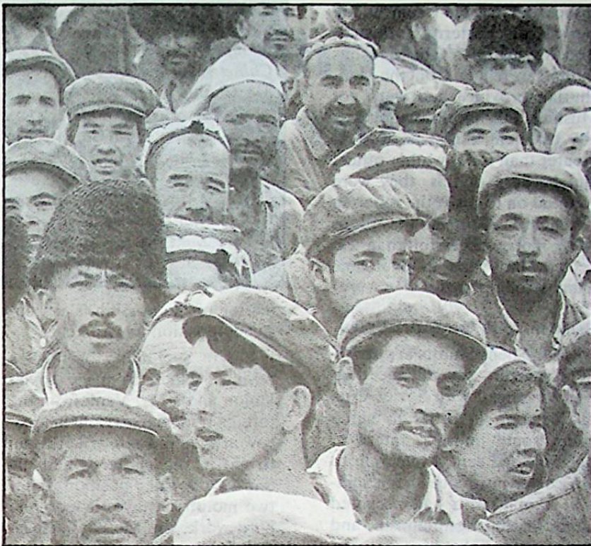
Eastern Turkistan: A constant struggle between its two giant neighbours, China and Russia.

The Islamic Republic of Eastern Turkistan also sought help for