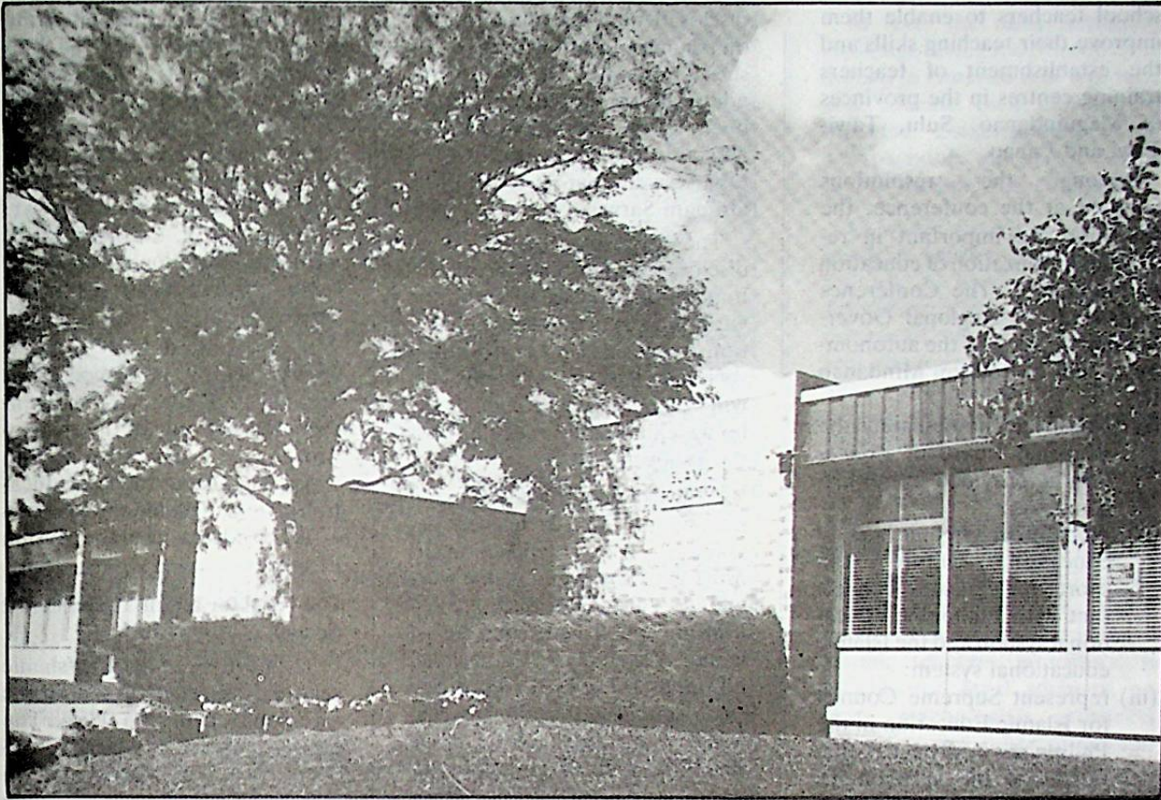
A school for Muslim children sponsored by the Islamic Foundation, Illinois, USA: Muslim communities realize the great importance of Islamic education for their children.