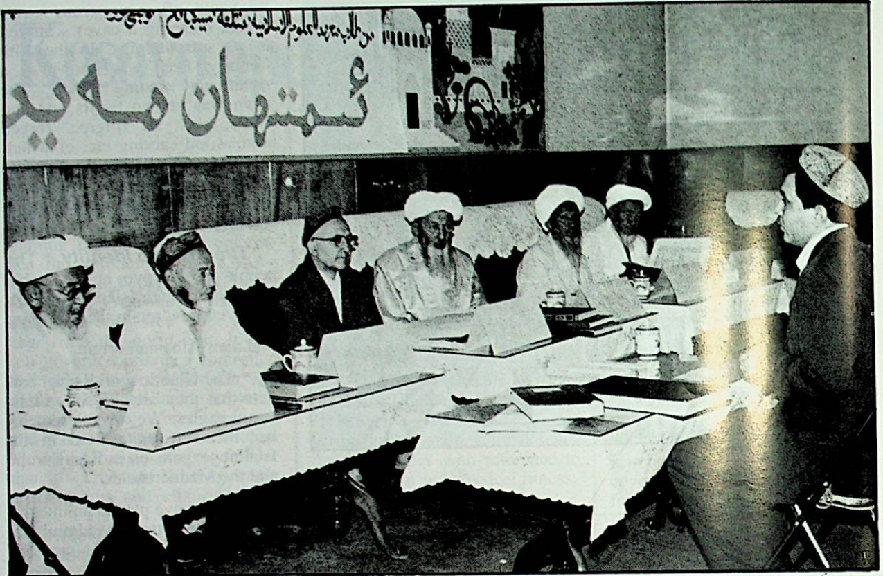
An Islamic institute located in Eastern Turkistan, where the selection process of students is in progress, as seen in the picture above: Never an 'inalienable' part of China, Eastern Turkistan has, in fact, remained a territory under Chinese occupation.