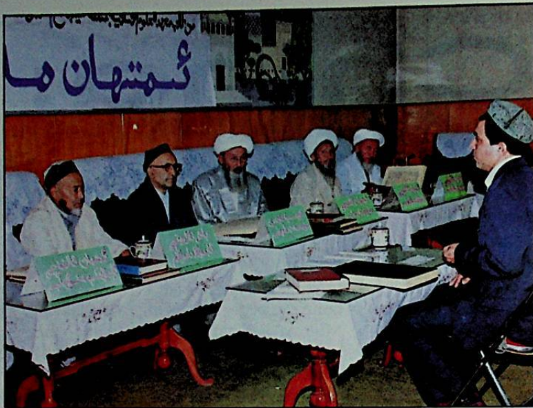
The Uighur Muslim population of Xinjiang (Eastern Turkistan) resent their Han Chinese neighbours as arrogant trespassers in their land.

The resentment has grown increasingly violent since 1990. Many young Uighurs envy their neighbours in the newly independent Muslim republics of Central Asia, although Beijing has warned the former Soviet states to give no aid or encouragement to the Uighur separatists. Xinjiang's young radicals have blown up bridges, bombed buses and assassinated local Islamic leaders,