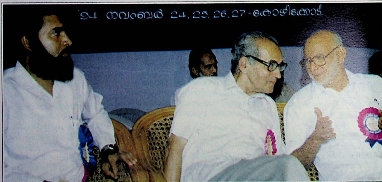
Muslim leaders at a community gathering in Kerala, South India. The Malabar Coast was the first to come in contact with Islam and Arab traders.

The Chinese commander Pan Chao reached the northern parts of the Arabian peninsula during