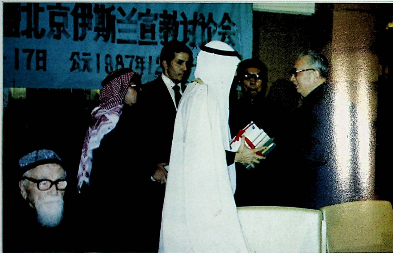
An Islamic conference held under the auspices of the Muslim World League, in Beijing, People's Republic of China: An effort to revive Islam's historical links with China.