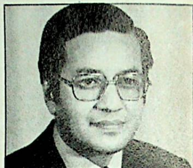
• 12 Malaysia: Outspoken Prime Minister Mahathir Mohamad is interviewed by Mohammad Salahuddin and Kamaruddin Ja'far