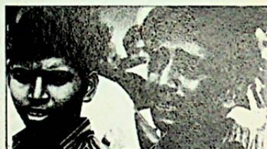
• 19 Bihari File: Stranded Pakistanis and the tragic legacy of the secession of East Pakistan — an Arabia Special Report