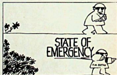
• 28 South Africa: Whitewashing a nuclear explosion — Evidence has come to light of the deliberate suppression by the US of the joint South African/Israeli detonation of a nuclear weapon in 1979; and Israel's successful acquisition of US nuclear timing devices