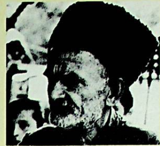
26 Tajiks' Islamic revival