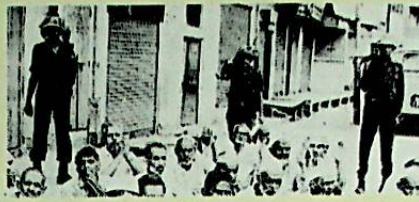
23 Meerut after 130 years