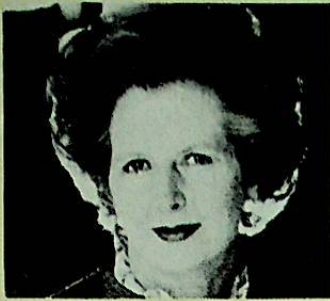
28 Thatcher's third term